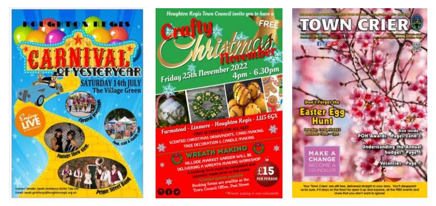
The Town Council funds a variety of community events throughout the year and the Town Crier circular