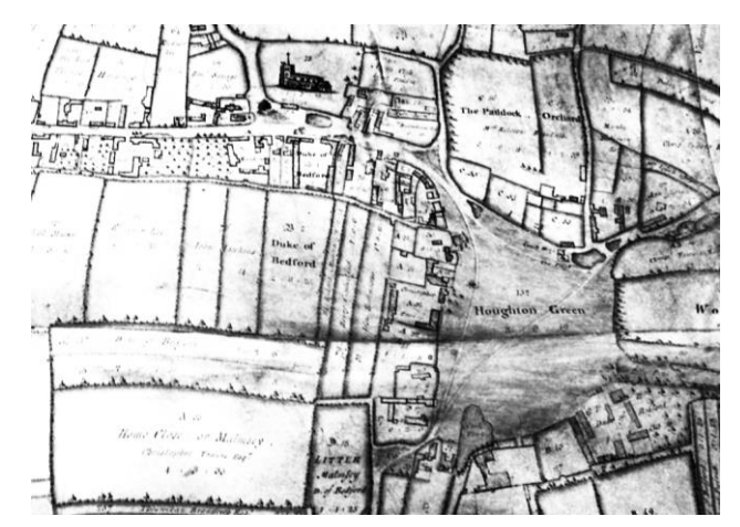
A plan of the High Street and The Green in 1800