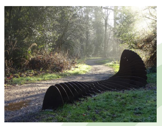
Woodland Walk, Houghton Hall Park