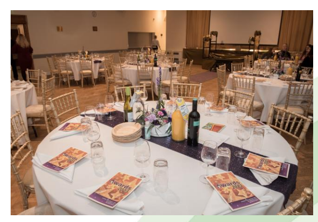
Before a ceremony for the annual 'Pride of Houghton' awards