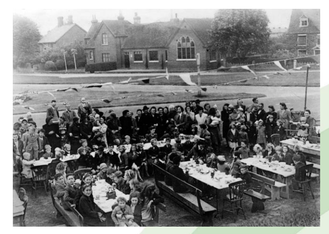
VE Day celebrations at The Green in 1945