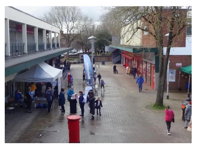
View towards All Saint Church from Bedford Square