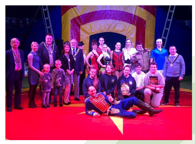
Performers from John Lawsons Circus with Councilors and residents at an event on the Green