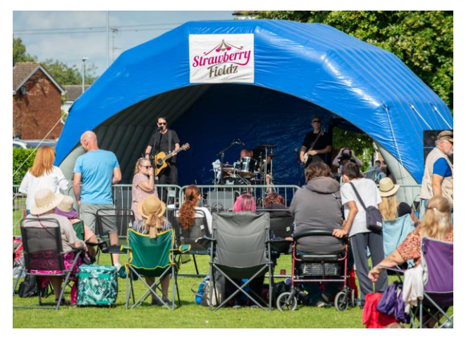
An image from the Houghton Rocks festival at Parkside Recreation Ground in 2023