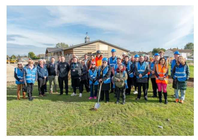
Groundbreaking event for new facilities at Tithe Farm Recreational Ground