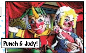
Punch & Judy!

Procession leaves at 10:30am from Houghton Regis Academy, Parkside Drive,