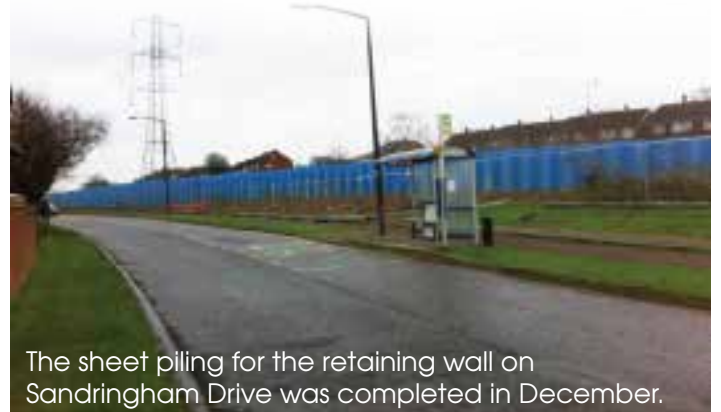
The sheet piling for the retaining wall on Sandringham Drive was completed in December.

Questions can be emailed to woodsidelink@centralbedfordshire.gov.uk or call 0300 300 5289.